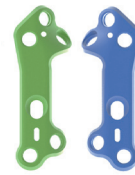
1 st MTP arthrodesis plate Size 2