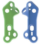
1 st MTP arthrodesis plate Size 1